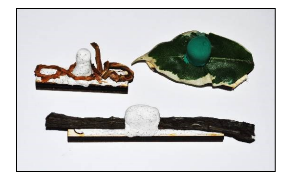
Figure 5 First prototype tangibles from top left: twisted grass, leaf and stick.

The first prototype had a default set of three pseudo symbols simply to provide a point of discussion (Figure 5). Other tangibles could be added by the process described above. Three members of the community explored this prototype.