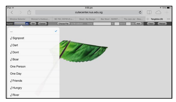
Figure 4 User Interface showing available images

Figure 4 shows the software menu. The top-left dropdown list contains a list of all available images. Those that have a tangible registered to them are marked with a tick. To add new images, the software allows users to choose a file, associate a name with it and set the size of the image. The "Clear" button clears the canvas and the "Reload" reloads the software from the server.