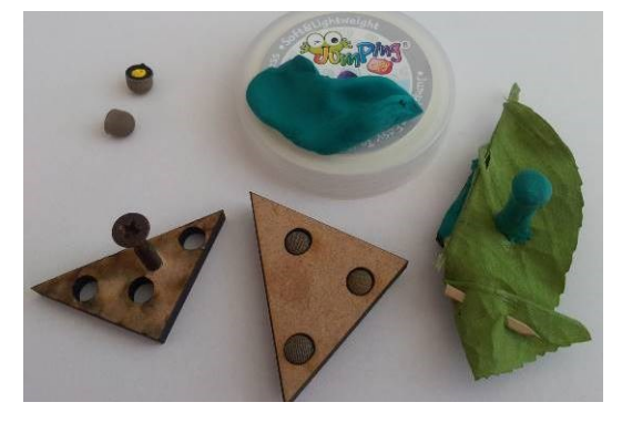
Figure 3 Tangible construction (from top left): a) pen tips with clay inside, b) conductive clay, c) MDF tangible baseplate with screw handle d) underside of the baseplate with pen tips in holes, e) a completed tangible.

dry modeling clay is then used as a conductive medium to join the tips, hold the Oroo' symbol in place and provide a grip for the user. Depending on the shape of the symbol, a handle made of a metal screw covered in clay may be added to the top of the baseplate.